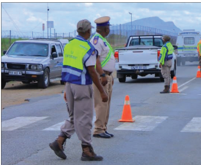
The SDM has conducted the R37 Road Safety Awareness Campaign at Ga-Manyaka ahead of the Easter holidays long weekend.

to launch its Provincial Road Safety government," said Cllr Mafefe. Easter Campaign here on the 11 The event culminated in all April 2025 at Nthame Primary stakeholders conducting a stop School. This showcases how and search of all vehicles passing seriously we as government take through the R37 Road to check this issue, we are indeed a caring compliance and safety.