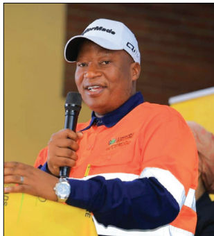
Limpopo MEC for Public Works, Roads and Infrastructure, Ernest Rachoene.

The commissioner of the Public Service Commission,