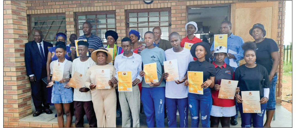
The class of top performing 2024 matric learners from Naledi Ya Meso Secondary School showing off their merit certificates during the awards ceremony.