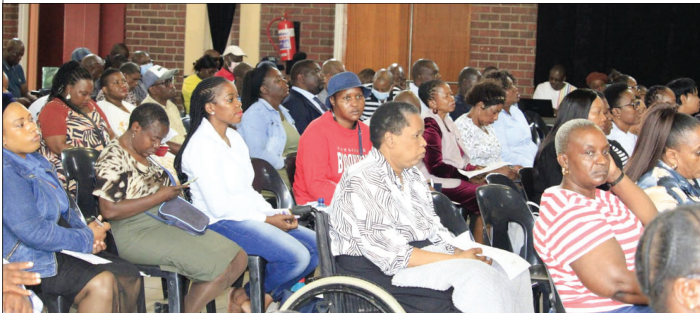
Attendees of the Limpopo provincial government's disability engagement session held in Polokwane which targeted public servants living with disabilities.

POLOKWANE - To amplify voices of public servants living with disabilities, the Limpopo provincial government organised a disability engagement session in Polokwane on 28 March.