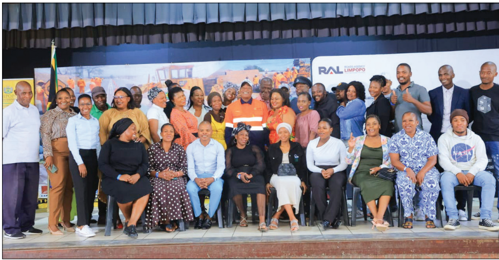
The new recruits of the Limpopo Department of Public Works, Roads and Infrastructure with MEC Ernest Rachoene.

LIMPOPO - Limpopo MEC for Public Works, Roads and Infrastructure, Ernest Rachoene made another move to bolster internal capacity of the department to be able to deliver on its mandate.