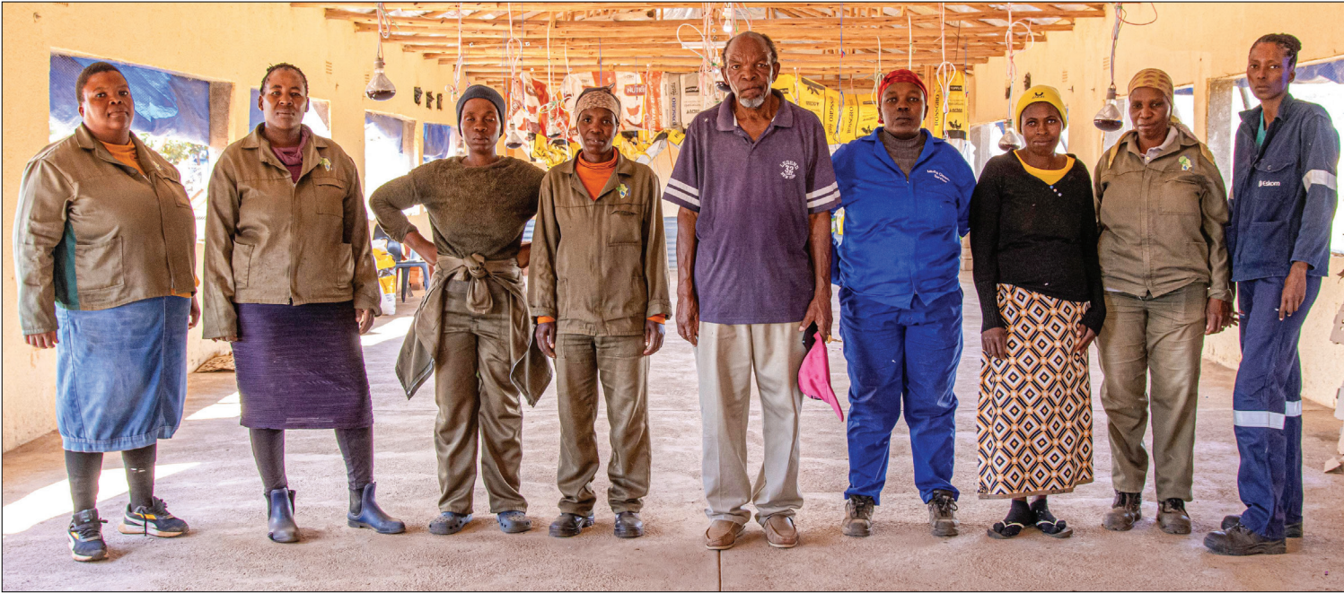
Members of the Topa Nama Cooperative in Ga-Mashabela Village within Makhuduthamaga Local Municipality.