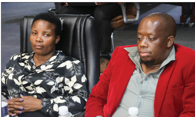
The EMLM Council sitting has adopted the 2025/2026 Draft IDP and Budget for public consultation.