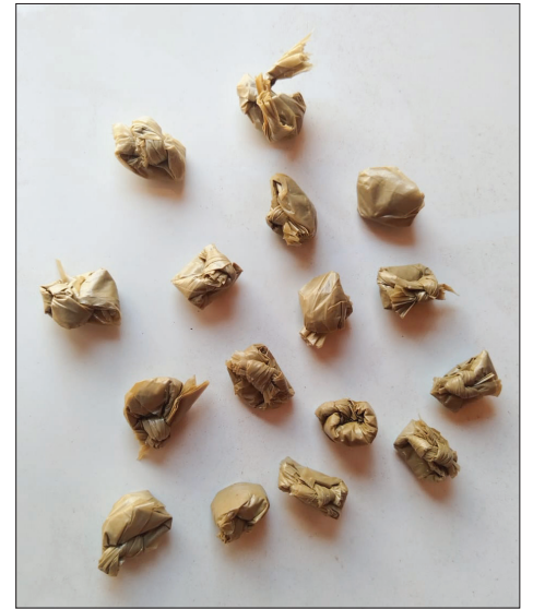
The ongoing Operation Shanela led to the discovery of illicit drugs.

LIMPOPO - Operation Shanela, also known as Kukula, resulted in the arrest of 427 suspects for various crimes across the five districts of Limpopo from March 24 until March 30.