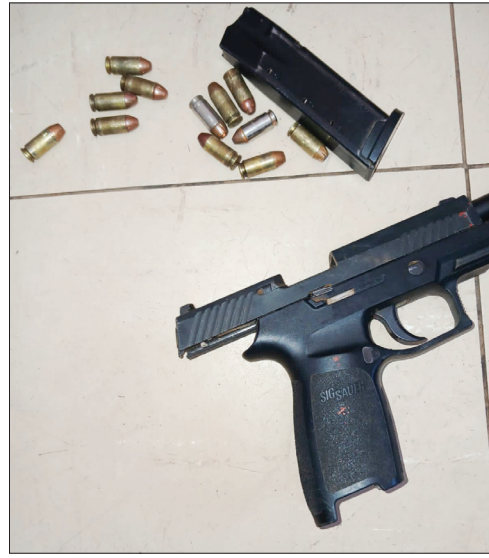
Unlicensed firearms and ammunition were recovered during the Police Operations Shanela which were conducted in the five districts of Limpopo Province.